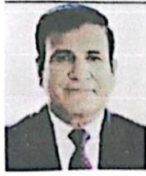
DEAN F.V.Sc & AH SKUAST-K